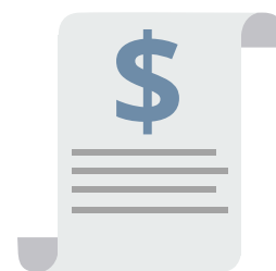
Invoice is generated and sent