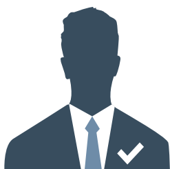
Invoice your customer