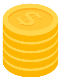
Collect the debt

At this level the module gathers all invoicing lines for that debtor case only. Then a global invoice is generated and sent to the customer.