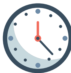
Validate all the invoices